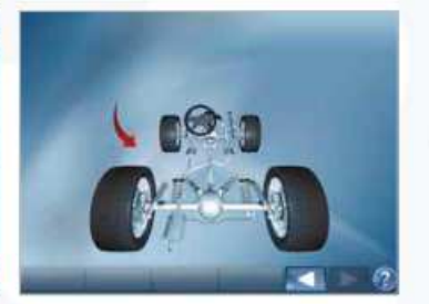
Adjust two axles in one screen Clear help for adjustment